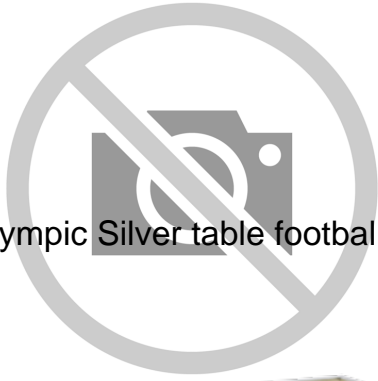
Garlando Olympic Silver table football with outgoing rods