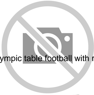
Garlando Olympic table football with retractable rods