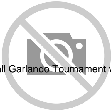
Table football Garlando Tournament with outgoing auctions