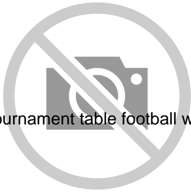
Garlando Tournament table football with retractable rods