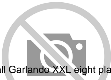
Table football Garlando XXL eight players with rods coming out of the long playing field