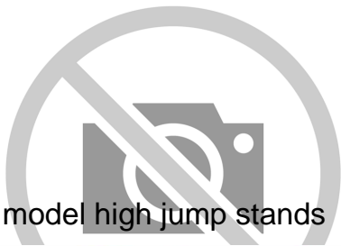
Pair of Club model high jump stands